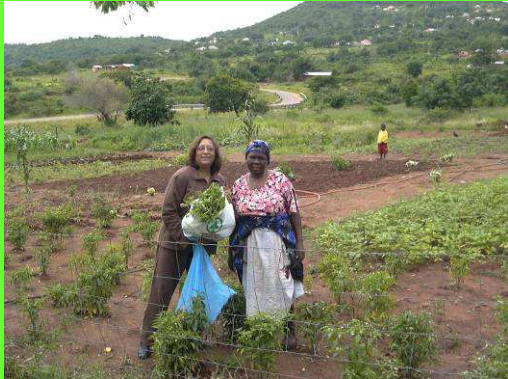
Vegetable gardens near Sethani Centre

Changing lives, transforming the community