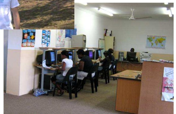
Computer courses are held regularly in the Resource Centre at Sethani (right)

Oaktree funded the building of the multi-purpose centre which offers computer lessons, access to technology, a well-stocked library, group counseling sessions, ministry and a wide range of adult education courses.