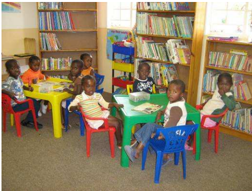
Children of Bongimpilo Creche having fun in Sethani's library and resource centre