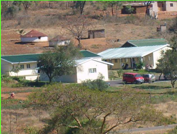
Sethani Centre in the heart of the community